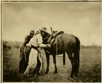
SADDLING A BUCKER.